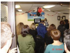
The view from the front door.