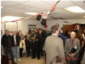
Friends and supporters gather around.